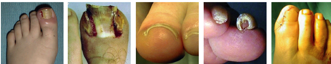
Mild ingrowing nail