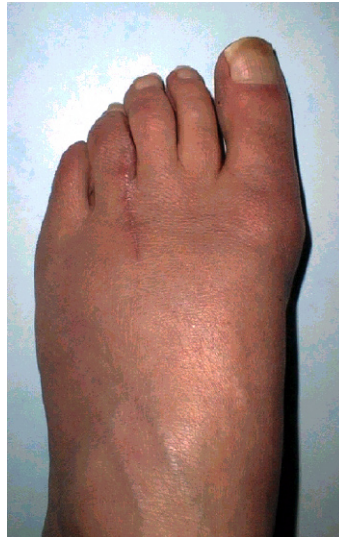
Neuroma Site Healed Photo 8 Weeks After Surgery